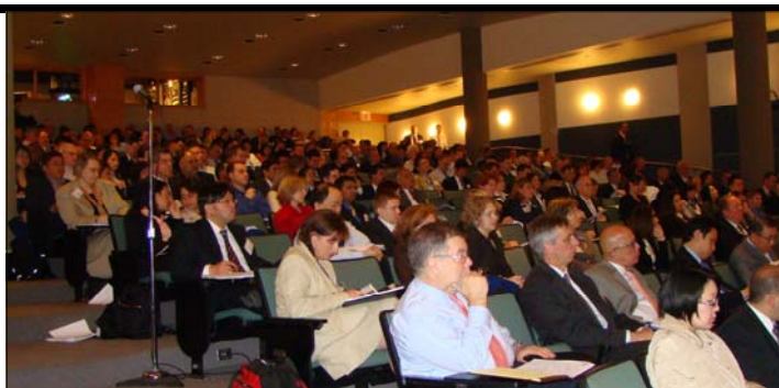
The Institute's annual AML seminar on May 19 th drew nearly 300 attendees.