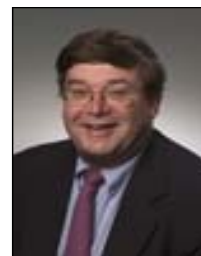
Charles E. Cook, Jr. Political Analyst.

our members to the Washington community in connection with the many issues affecting bottom-line results of internationally headquartered financial institutions operating in the United States. In addition to this critical importance to our government relations efforts, the conference provides an excellent opportunity for representatives of our member institutions from the U.S. and head offices as well as representatives of banking associations from around the world to meet informally and exchange views on key business and financial market developments.