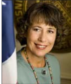
Sheila Bair, Chairman, Federal Deposit Insurance Corporation.