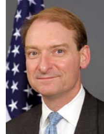
Paul Atkins, Commissioner, Securities and Exchange Commission.