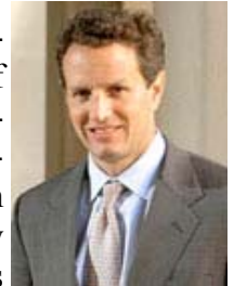
Timothy F. Geithner, President of the Federal Reserve Bank of New York.

Timothy F. Geithner, President of the Federal Reserve Bank of New York, will speak at the Institute's membership luncheon on Tuesday, October 18 th in New York. In his capacity as President of the New York Fed, Mr. Geithner also serves as the Vice Chairman and a permanent member of the Federal Open Market Committee (FOMC), which is responsible for formulating U.S. monetary policy.